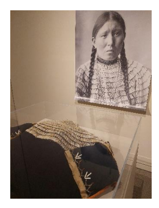
Installation of Lakota Beadwork exhibition.