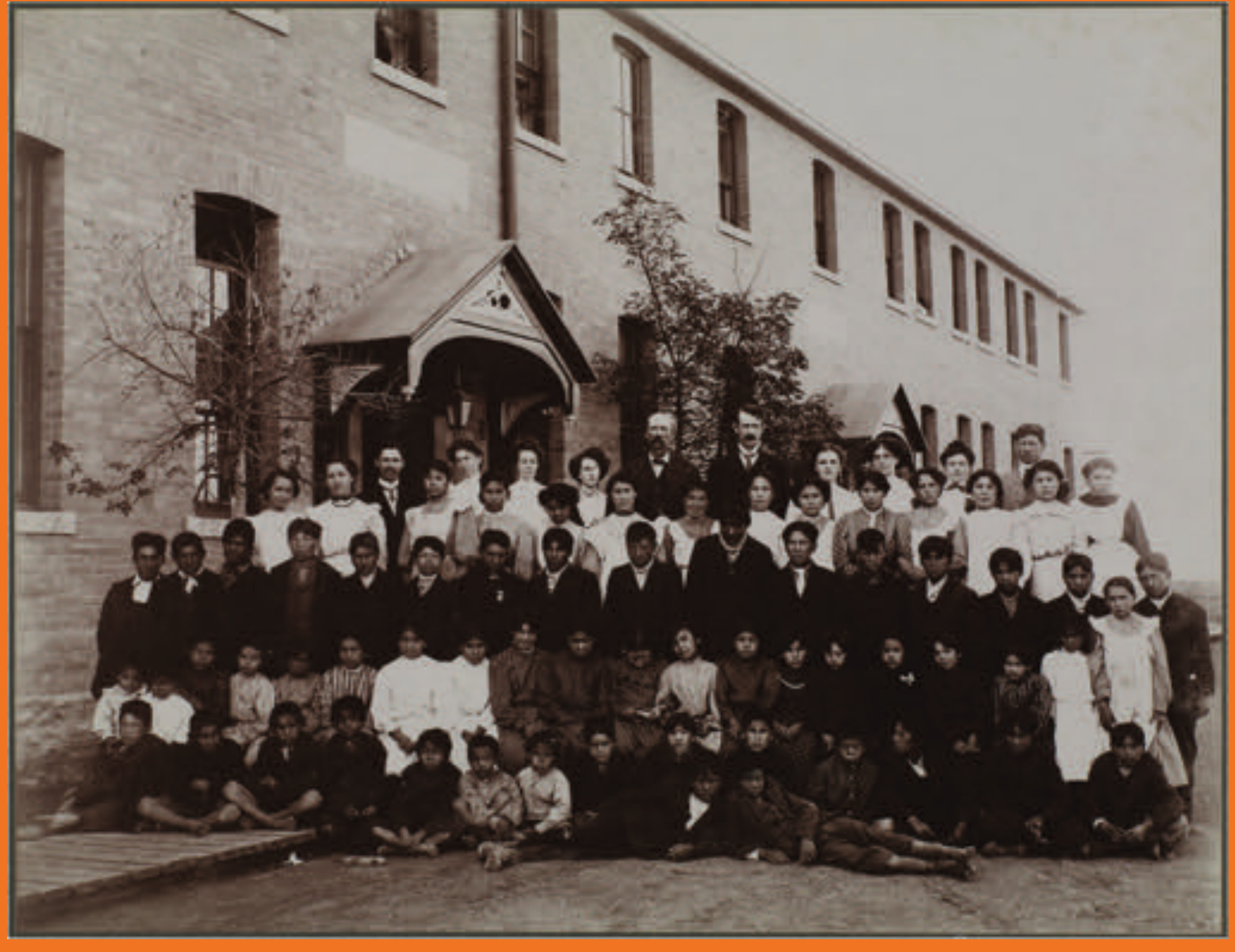
Regina Indian Residential School, students and school personnel, Saskatchewan, 1908.

Similar displays of memorial have taken place across the country. We hope that this presentation of the memorial at St. Andrew's United Church will open space for listening and learning about the truth of Indigenous experience in Canada, contributing towards discussion and reflection on Canadian accountability, for the trauma and atrocities of its colonialist systems, and commitment to making real change towards Truth and Reconciliation in support of the healing of Indigenous people across the nation for the benefit of our future generations.